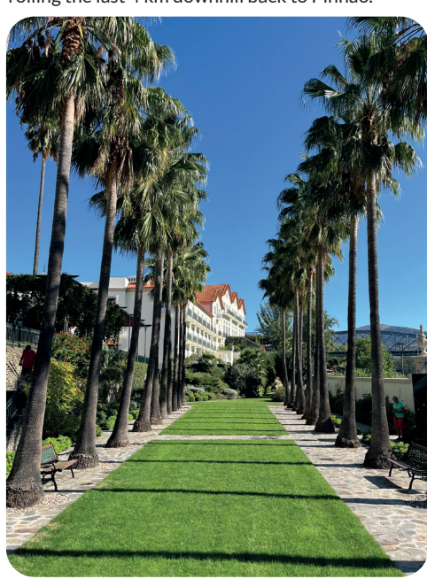
Day 8 Departure

Before setting off on today's cycling day, we stop at Pinhão station, which is well worth a visit. It is known for its predominantly blue tiled scenes that tell the story of rural life in Pinhão. The small winegrowing town is considered the center of the port wine region. The port wine trade has been at home here for decades and important wine farms are located in the surrounding area. In the morning, we cycle through vineyards and olive groves with sweeping panoramic views up to Favaios, whose historic village center is a listed building. Another picnic with a view awaits us on the way. We visit the "Pão e Vinho" (bread and wine) museum and enjoy a glass of "Moscatel do Douro", which is only grown here, on the panoramic terrace. We then roll downhill through the vineyards to the small village of Casal de Loivos. Here we visit a family-owned historic oil mill and taste the local wine before rolling the last 4 km downhill back to Pinhão.