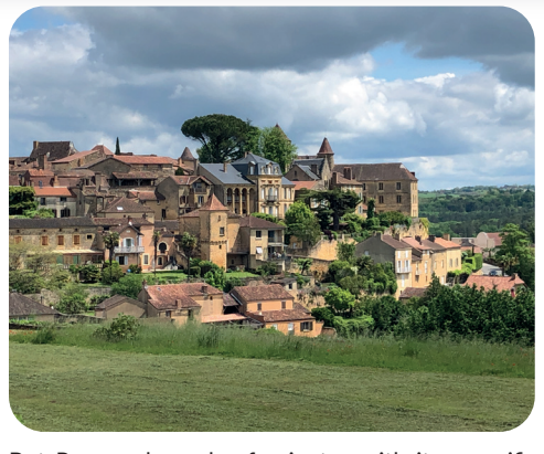
But Rocamadour also fascinates with its magnificent location. Nestled against the rocky hillside, it can be seen from afar. After an extensive tour and a picnic in a fantastic location, today's cycle route leads along small, rural and quiet paths to the River Dordogne. From here you cycle along picturesque river bends to Soulliac. Return transfer.

Rocamadour - famous medieval pilgrimage site on the way to Santiago de Compostella. Pilgrims have been staying in this picturesque town since the Middle Ages and have led to the construction of chapels, churches and crypts. On the day of the "Grand Pardon", up to 30,000 pilgrims gather in Rocamadour to visit the 7 churches and chapels: the Basilica of Saint Sauveur, the crypt of St Amadour, the chapel of Notre Dame and the chapels of St Jean Baptiste, St Blaise and Ste Anne.